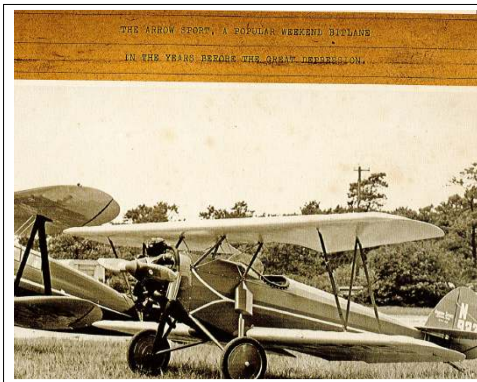
THE ARROW SPORT, A POPULAR WEEKEND BIPLANE IN THE YEARS BEFORE THE GREAT DEPRESSION.